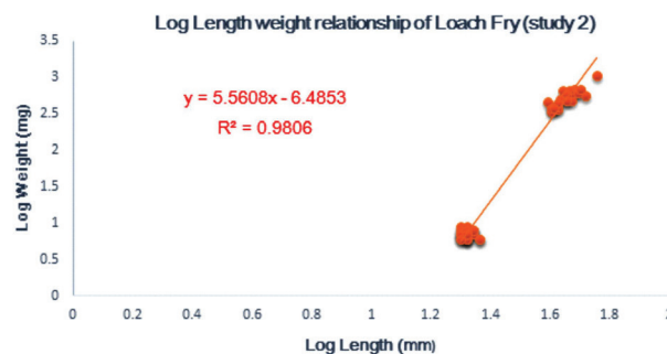
Fig: 2 Length-weight relationship of loach reared in lined pond provided without sand substratum