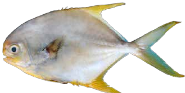
Fig. 1. Silver pompano, Trachinotus blochii , an ideal candidate for tide fed traditional shrimp pond

Silver pompano, Trachinotus blochii (Fig. 1) is a high-value marine finfish, which is of high demand among restaurants and consumers. This fast-growing carangid is relatively still new to the Indian aquaculture sector, although pompano culture has been established in many Asia-Pacific countries like Taiwan and Indonesia (Gopakumar et al., 2012). With the standardized seed production technology by ICAR-CMFRI (Nazar et al., 2012), the aquaculture of this species in the country is slowly gaining momentum. T. blochii is amenable for farming in ponds, tanks, floating sea cages, and even in salinities as low as 10 ppt (Madhuri et al., 2019) to 15 ppt (Kalidas et al., 2012). The feasibility of culturing T. blochii in brackishwater shrimp culture ponds with high survival rate, appreciable FCR and meat quality has been reported (Jayakumar et al., 2014).