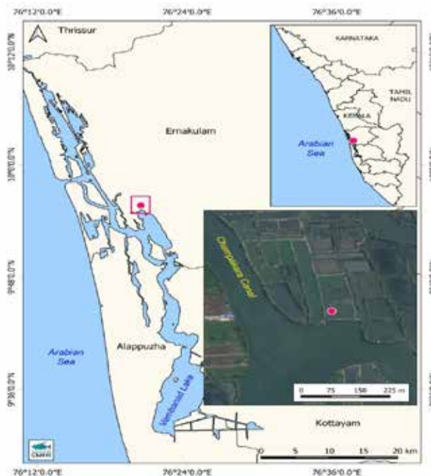
Fig. 2. GIS map of the study area

The present case study was carried out in a shrimp culture pond of 1 ha area affected by WSSV for 2 consecutive crops during November to January, at South Kochi, near Tripunithura, Kerala, India (9°55'39.85" N, 76° 20' 17.40" E) (Fig. 2). The water intake to the culture pond was from the open water system through sluices depending on the tides. The salinity varied from 4-19 ppt and the average water pH ranged from 6.8-8.26, which were in the ideal range for pompano farming.